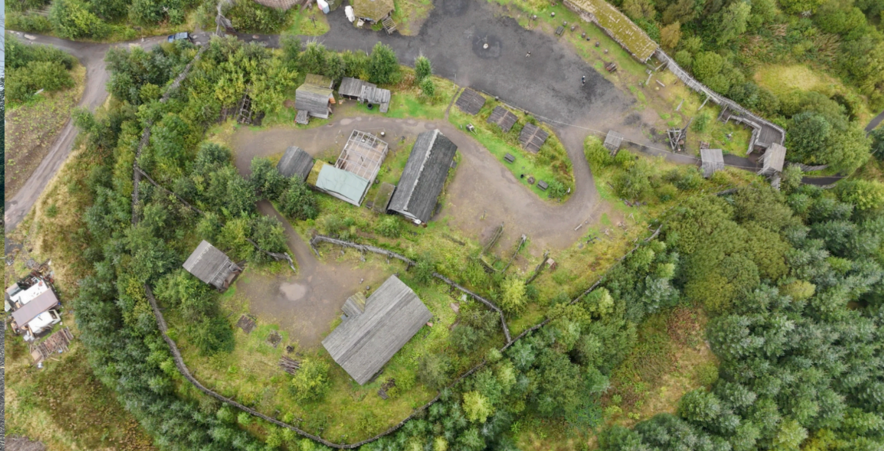
EDEN - LOCATION RECCE