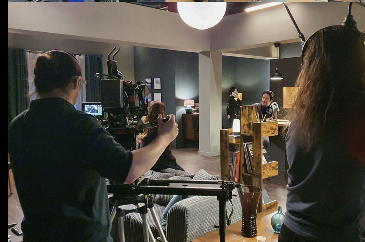
TARTAN BRIDGE STUDIOS - LIVINGSTON