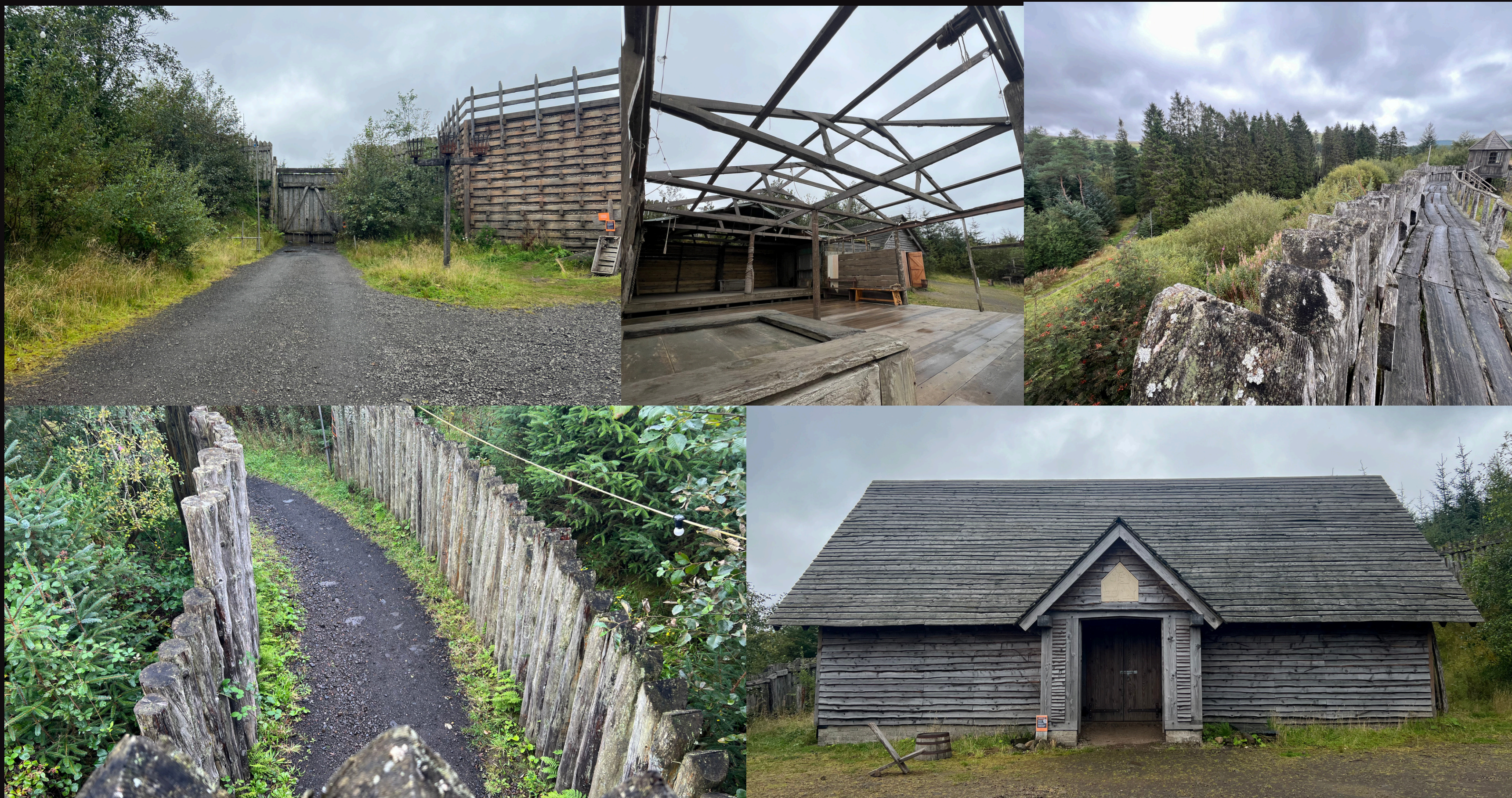
EDEN - LOCATION RECCE