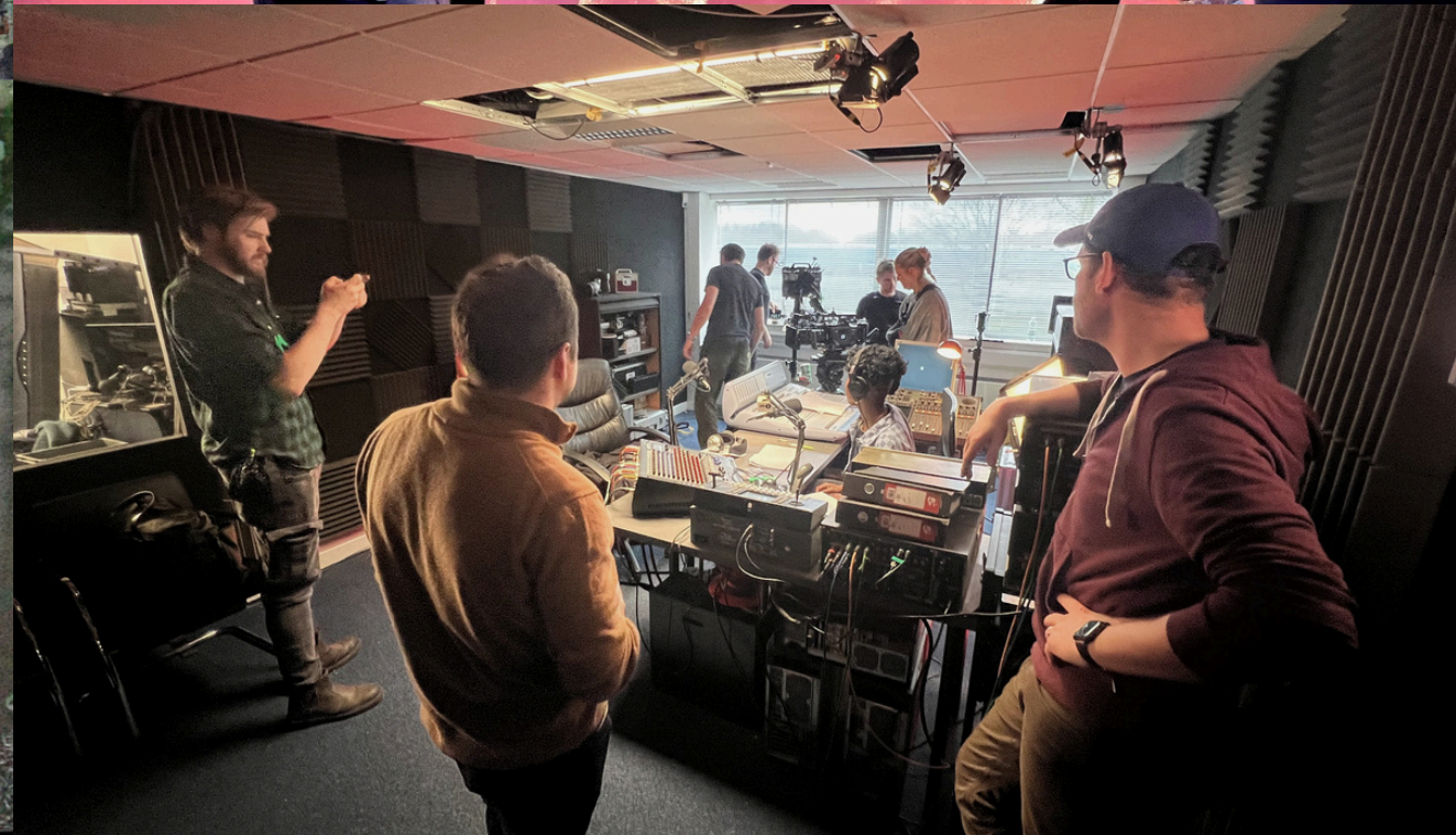
TARTAN BRIDGE STUDIOS - LIVINGSTON