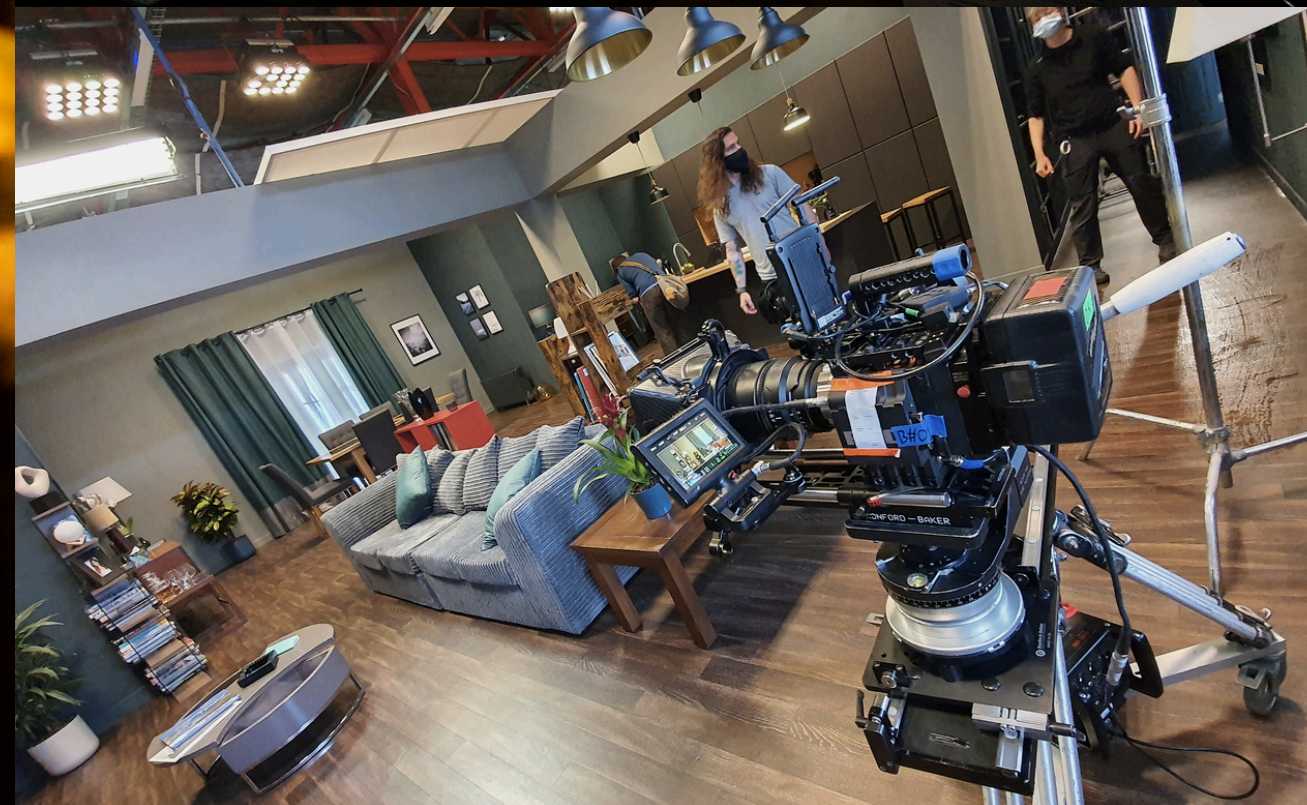
TARTAN BRIDGE STUDIOS - LIVINGSTON